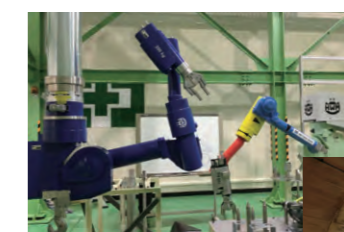
The remote system demonstration room

In the field of social infrastructure, we have developed an electromechanical manipulator jointly with a German special manufacturer of manipulators for nuclear power, that employs the world's first sensorless control technology for decommissioning work which has a radiation resistance more than double that of conventional nuclear power manipulators. A remote system demonstration room has been set up at Tamano Works to strengthen and expand the remote control systems business. We are also working on the development of radar exploration technology for surveys and inspections as well as technology for large-scale bridge repairs in order to meet the needs for maintenance and repairs associated with aging transport infrastructure (tunnels, roads, bridges, etc.).