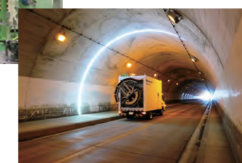
Tunnel Lining Scanning Car "Tunnel Catcher 3"

Mitsui E&S is working on the development of production, analysis, and AI technologies as its fundamental technologies across the Group. In production technology, we are improving productivity through technologies such as welding automation, automatic production plan creation, and 3D digital measurement. We are also visualizing processes using IoT, improving capacity utilization rates, and saving manpower. In analysis technology, we are providing design support through advances in coupled analysis that combines structural analysis, fluid analysis, and mechanism analysis. In addition to this, we are aiming to increase the added value of products through AI image recognition technology that utilizes open software.