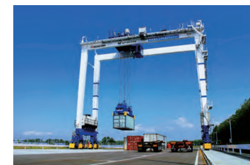
The Transtainer® and test area used for development work

In the field of port cranes, a test Transtainer® (container transfer crane) and a 100 meter long testing area have been set up at Oita Works with operations having been started in October 2018. At the same time as automating new terminals and doing checks and testing for remote access and automation of existing cranes, we are building a total solutions package that connects different types of software including systems that operate and manage automated terminal equipment.