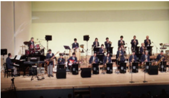
An autumn concert held in November 2016

I play trumpet in the band and act as MC at local events. Nothing makes me happier than the positive feedback I receive from the audience while emceeing and the favorable comments they give us after a performance. The band consists of a variety of people, including veterans and young players and both men and women, but we are united in enjoying playing during our performances. We will continue playing so that many more people will enjoy our performances.