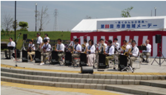
Performance at a local May Day event in Ichihara in April 2017