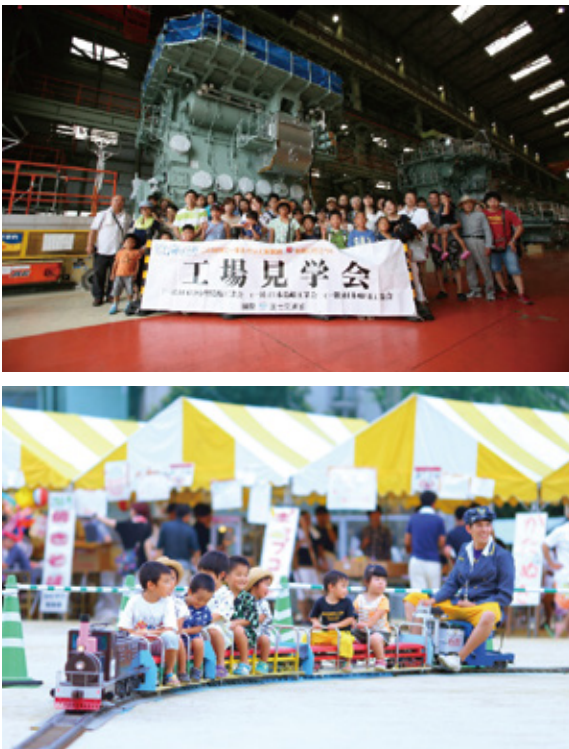
The festival attracted about 15,000 people, including families.

We hold the Summer Festival to repay our obligation to the local community. I was happiest to see the smiles of the families who live in Tamano as a company town. I was also glad that the event caused many children to yearn for the ocean and ships. In 2017, when we will celebrate our centenary, we would like to express our gratitude to Tamano City and Okayama Prefecture because we are very happy to have been with them.