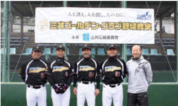
Instructors for the 15th Mitsui Golden Glove Baseball Class

At MES, we have co-sponsored a range of cultural activities as a member company of the Mitsui Public Relations Committee, which consists of 24 Mitsui Group companies. This committee carries out a variety of activities aimed at "enriching society by cherishing people and respecting diverse personal characteristics," working in line with the characteristics of the Mitsui Group described as "Mitsui is People." Examples include the MITSUI Golden Glove Award, an award that stresses the importance of fielding in professional baseball, and the Mitsui Golden Glove Baseball Class for boys' baseball coaches, which is held by inviting winners of the award to be instructors. The Mitsui Public Relations Committee is also proactive in cultural and art activities. For example, it created the MITSUI Golden Takumi Award in 2015 with a desire to create an opportunity to attract attention and admiration to people involved in "Tradition x Innovation."